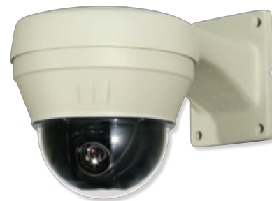
Indoor/Outdoor Wall Mount