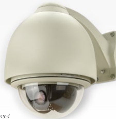
Outdoor Wall-mounted Speed Dome