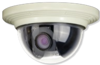
Indoor Flush Mount