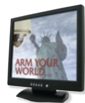
LCD1920HG 19" LCD Monitor Also Available in 15" and 17"