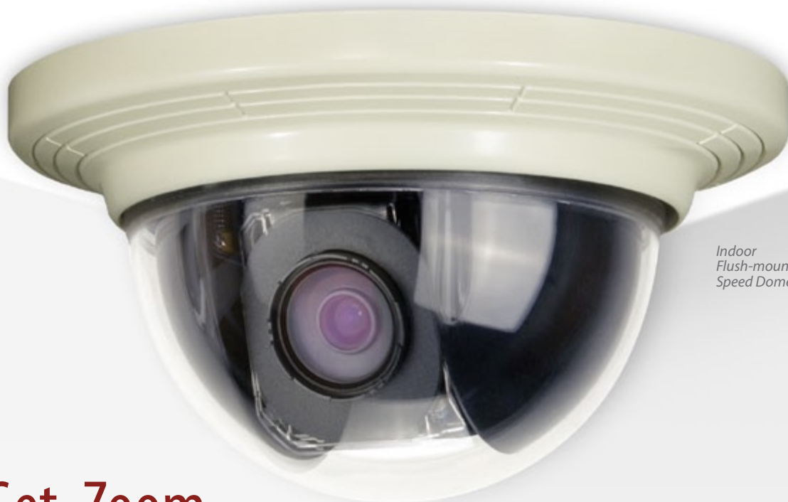
Indoor Flush-mounted Speed Dome