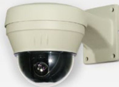
Indoor/Outdoor Wall-Mounted Mini Speed dome