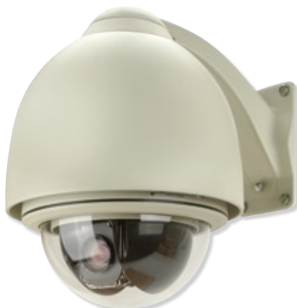
Outdoor Wall Mount